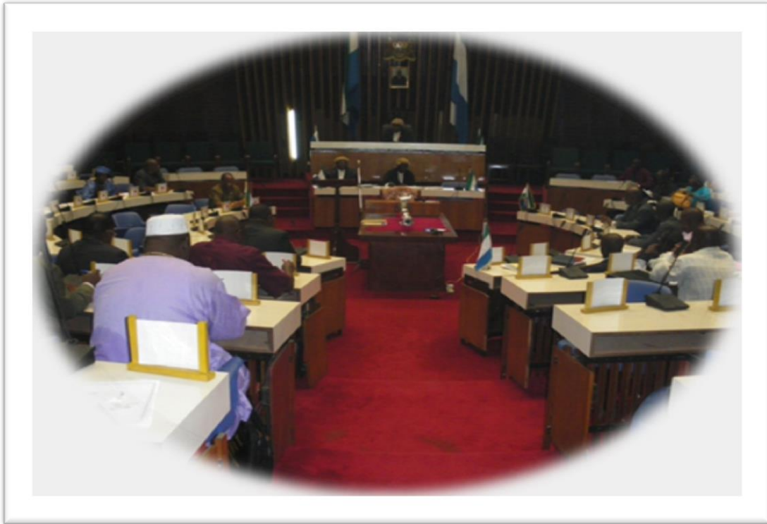
THE CHAMBER OF PARLIAMENT OF THE REPUBLIC OF SIERRA LEONE