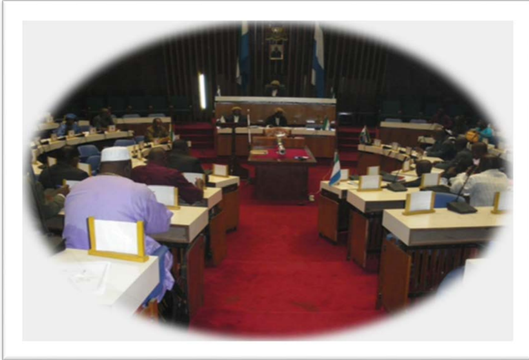
THE CHAMBER OF PARLIAMENT OF THE REPUBLIC OF SIERRA LEONE